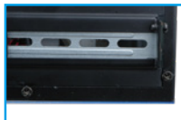
1 x Expansion slot (PCI/PCIe) 1 x Internal 2.5" HDD bay