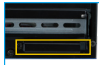
1 x Expansion slot (PCI/PCIe) 1 x CF slot